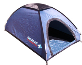
1 kg. (2.2 lb.) Tent