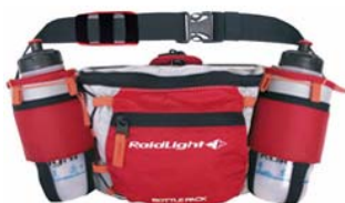
Light Bottle Belt