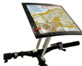
MTB Rotating Map Holder