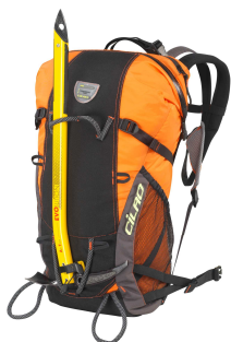
iZi 33 725 g / 33 litres

Along the same lines, the rucksacks are gaining ground thanks to their exclusive carrying concept, the air-go concept (CiLao patent): double-strand straps providing exceptional comfort and stability (weight distributed across the two strands). They come with a whole range of ingenious iZi accessories including straps and additional pockets.