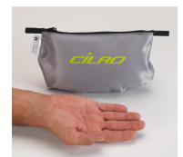
OZ 22 EXPERT 145 g