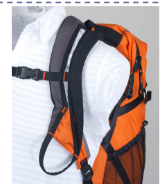
air-go concept by CiLao

Along the same lines, the rucksacks are gaining ground thanks to their exclusive carrying concept, the air-go concept (CiLao patent): double-strand straps providing exceptional comfort and stability (weight distributed across the two strands). They come with a whole range of ingenious iZi accessories including straps and additional pockets.