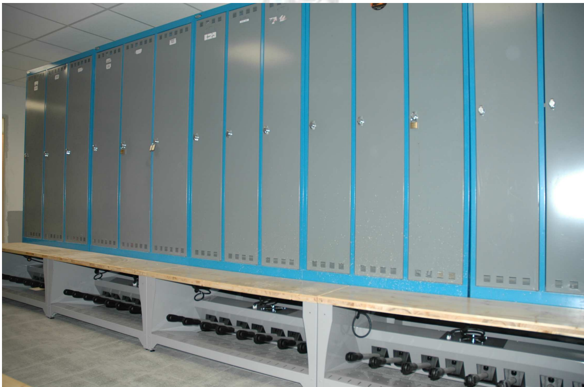
Ski lockers and boots drying bench in a ski school

KORALP's products are also intended for the mountain professionals: ski schools and ski lift companies, with the KORALP EXPERT 's range.