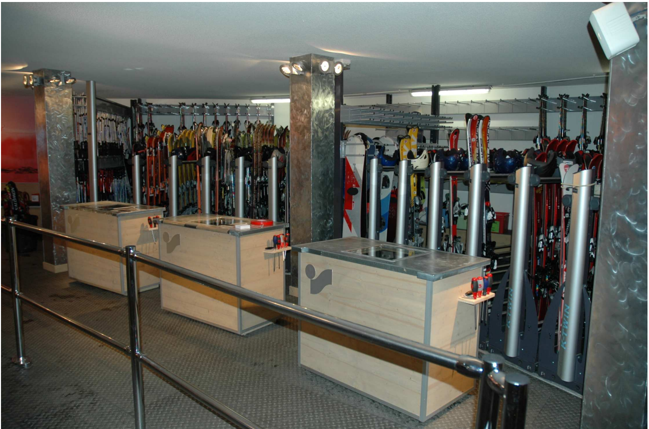
Implantation in a rental ski shop

KORALP PROSHOP's range offers drying and stocking solutions to sport shops and rental ski shops.