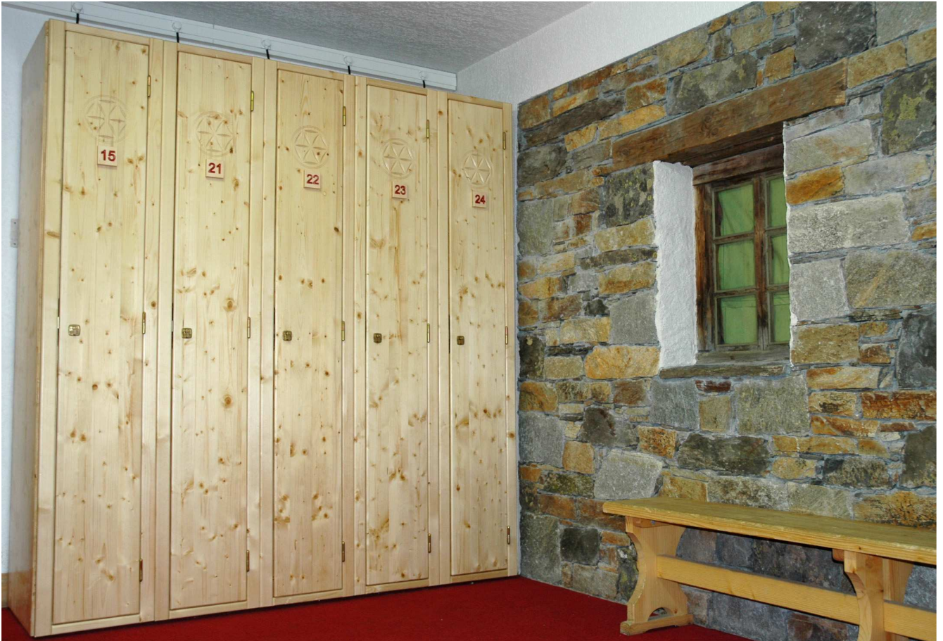
Hotel ski room

Thanks to its competence in its domain, the society has known how to adapt its offers to the accommodation actors present in mountain (hotels, residences and chalets) with KORALP LODGE brand.